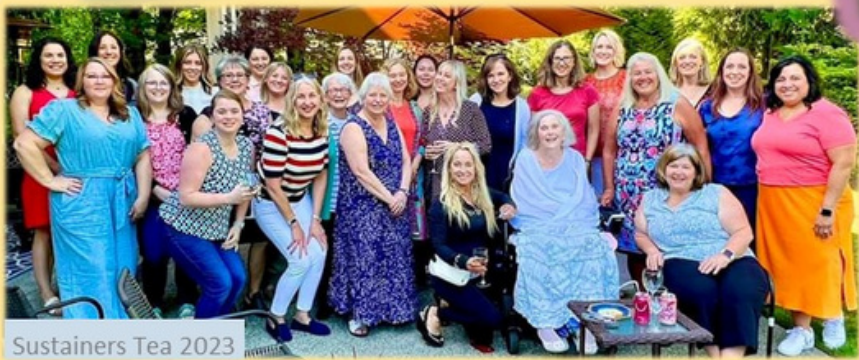
Sustainers Tea 2023